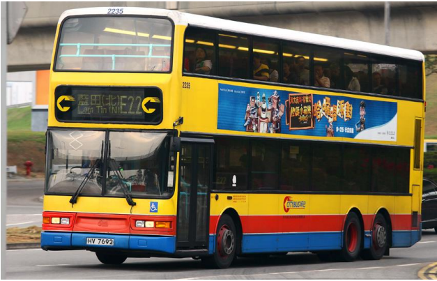
E22 Airport Bus

Airport Bus route E22 departs from the airport every 15 minutes which takes around 45 minutes to arrive at HKBU Junction Road station , which is just 10-minute walking distance to NTTIH. https://mobile.citybus.com.hk/nwp3/?f=1&ds=E22&dsmode=1&l=1