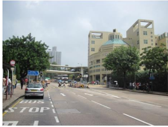
HKBU Junction Road station